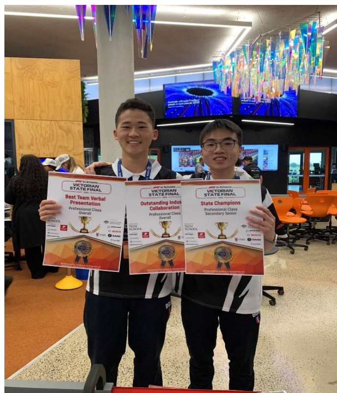
(The joy moment after the award)

In this competition, All the members of Phantom Racing showcased a variety of skills and knowledge such as physics, aerodynamics, design, manufacturing, branding, graphics, sponsorship, marketing, leadership/teamwork, media skills, financial strategy, The application with constant time and repetition to ultimately make them to reach the highest standards in the competition. Well done boys!!!