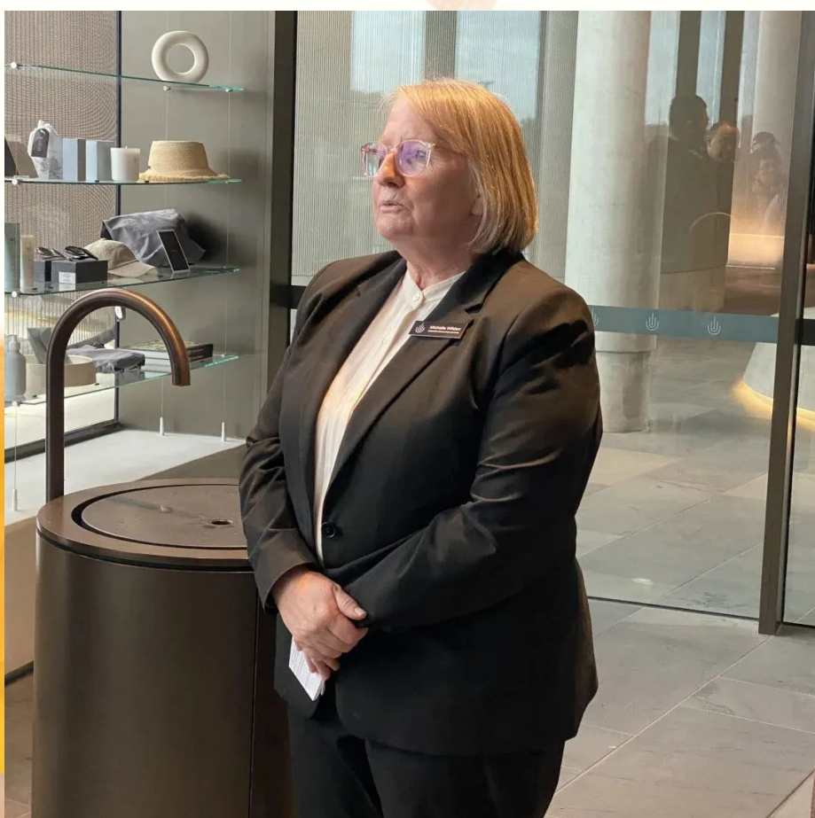
Hot spring staff process introduction