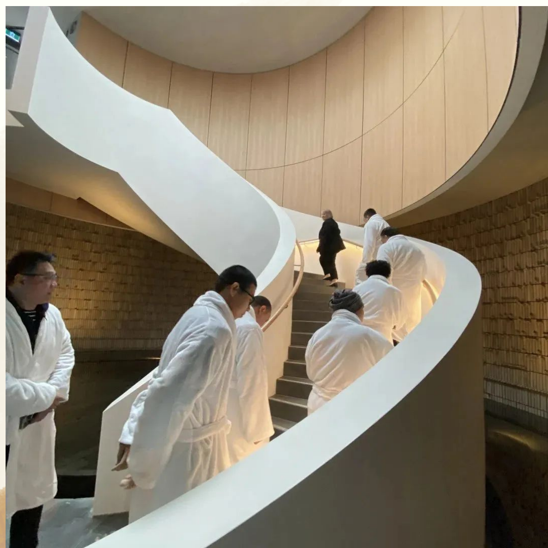
Investors visit hot spring facilities